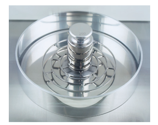
Open-work weighing pan